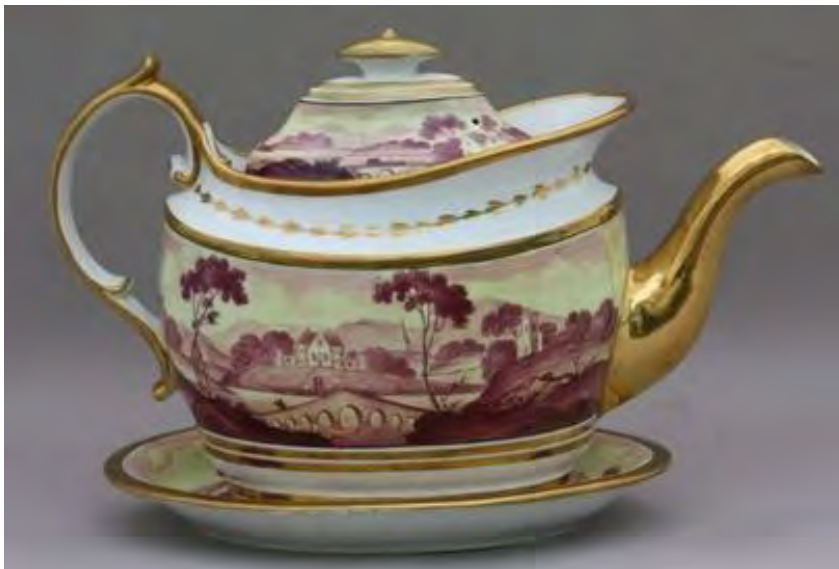
Herculaneum Pottery, Toxteth, Liverpool, England Teapot from the Spalding service, c. 1810 Porcelain, private collection

About the lecture: The focus of this talk is two Herculaneum porcelain tea services that were found in California. Until recently little was known about the Herculaneum Factory, which was built in 1796 near the Port of Liverpool to take advantage of the market with America. Until 1840 Herculaneum supplied ceramics to ports on the East Coast. The history of the factory and examples of their wares will be discussed. By using genealogical resources it was possible to trace the original New England owners of both the Little and Spalding services and to discover their remarkable family history.