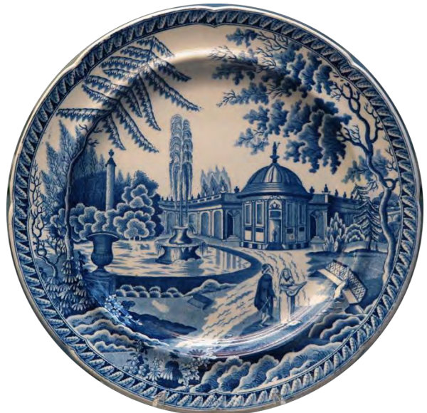
Herculaneum Pottery Plate with a garden scene, 1809 Lead-glazed earthenware (pearlware) with transfer print Walker Art Gallery, Liverpool