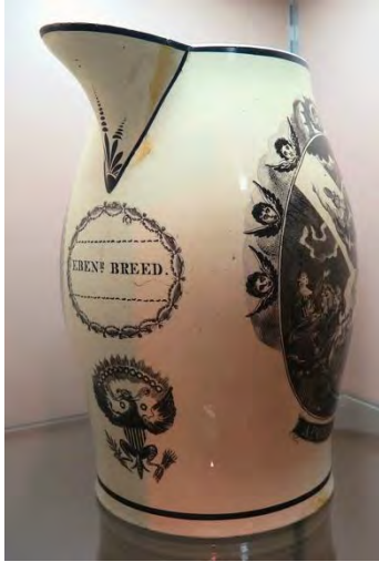
Herculaneum Pottery Jug with the Apotheosis of Washington, c. 1805 Lead-glazed earthenware (pearlware) with transfer print Potteries Museum, Stoke-on-Trent

The jug is inscribed to Ebenezer Breed, a New England shoe manufacturer.