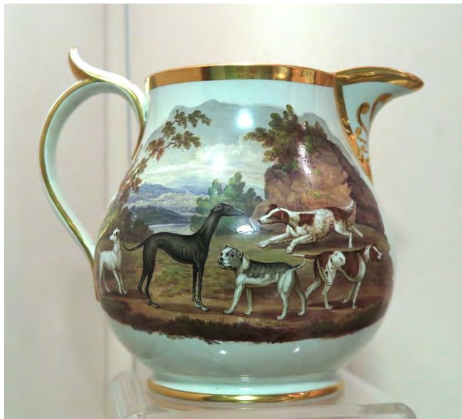
Herculaneum Pottery Jug with hunting dogs in a landscape, c. 1800-20 Lead-glazed earthenware (pearlware) with hand-colored transfer print Walker Art Gallery, Liverpool